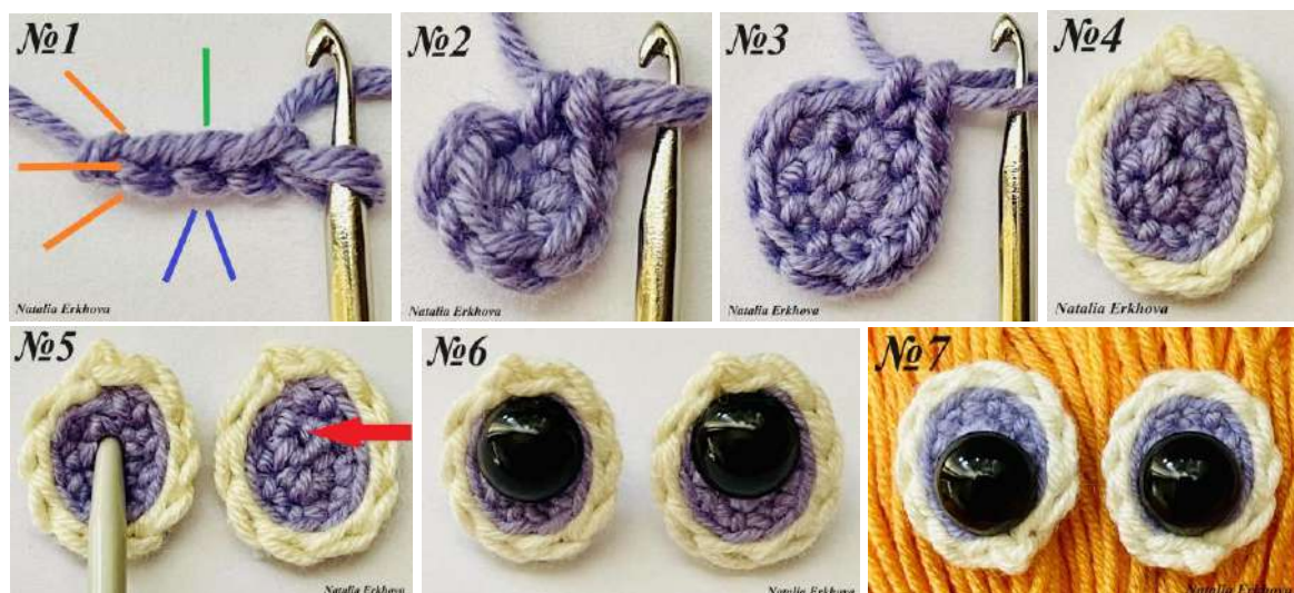
Photo № 6 – finished eyes. But when you insert the eyes into the toy, you have to turn them over, as shown in photo № 7.

Insert the eyes into the 2nd chain (photo № 5 – indicated by an arrow). You can wide the hole using a knitting needle or scissors (photo № 5, a knitting needle is used).