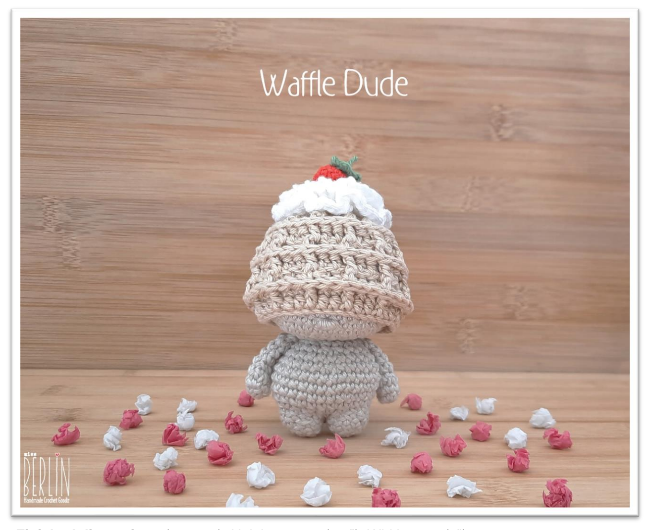
Finished dimensions (approx.): Height: 9.5cm (3.7"). Width: 5cm (2").