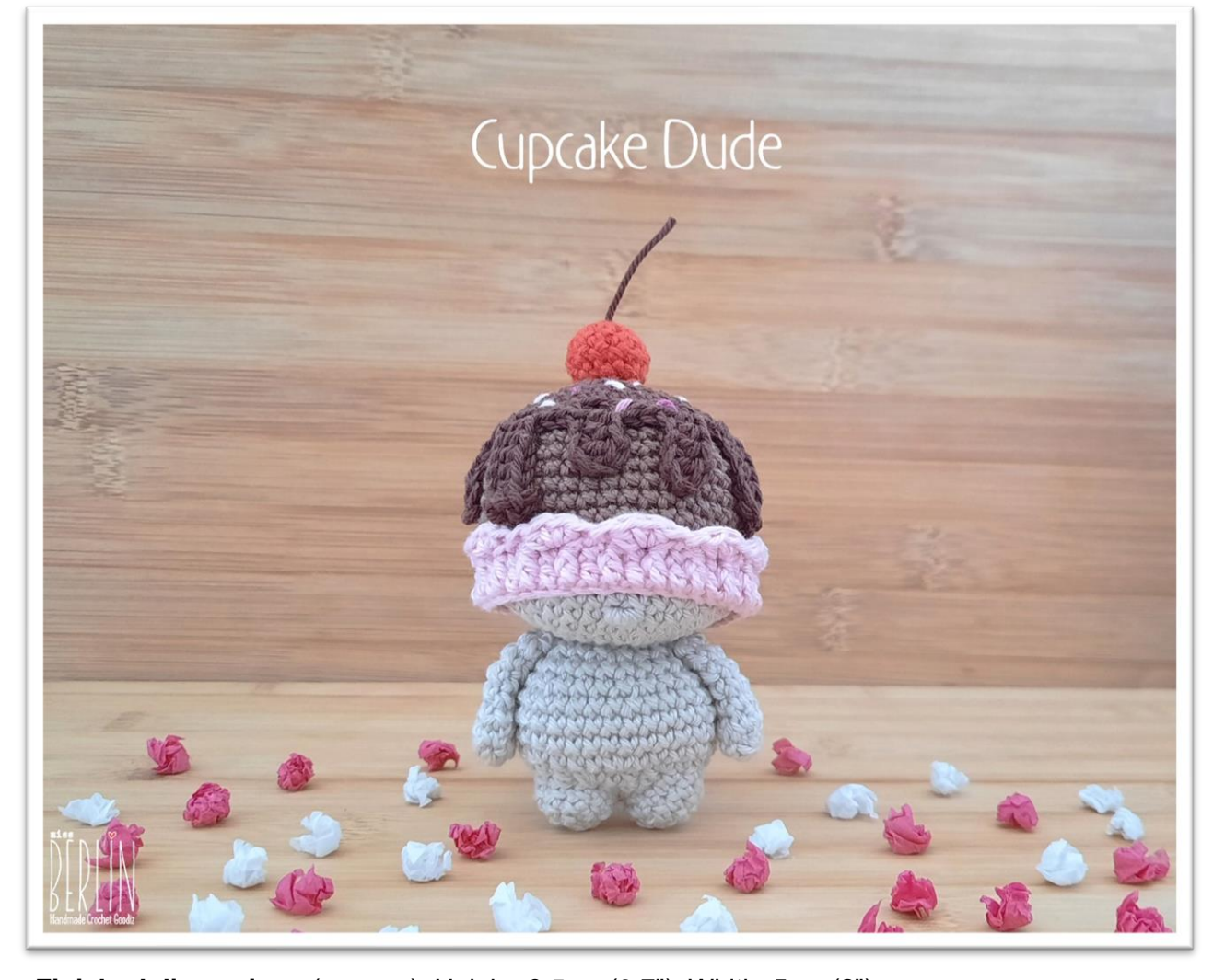
Finished dimensions (approx.): Height: 9.5cm (3.7"). Width: 5cm (2").