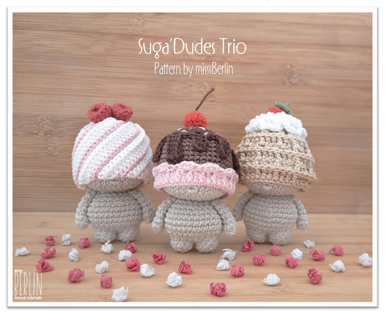
This is an original design by @misssBerlin © All rights reserved. misssberlin.etsy.com ♥ instagram.com/misssberlin/ ♥ pinterest.com/misssberlin/

The little Dudes live among us, but only a child at heart can truly see them. They are bald and shy, so they cover their heads and half of their faces with whatever they find in their surroundings.