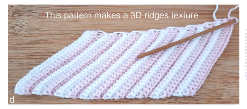
Rule of Thumb Always increase on one side and decrease on the other to get the parallelogram shape.

Repeat rows 2-3 14 more times, alternating between the colors, so you have 8 rows of each color.