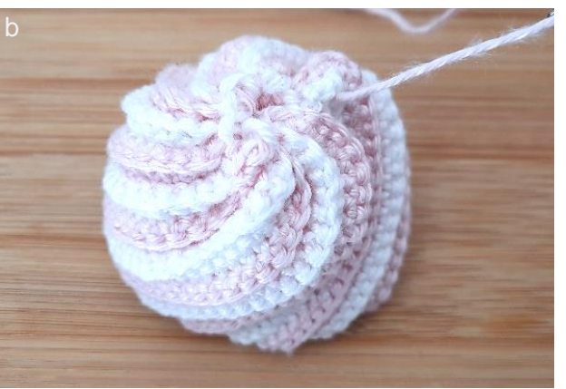
FO and weave in the ends.