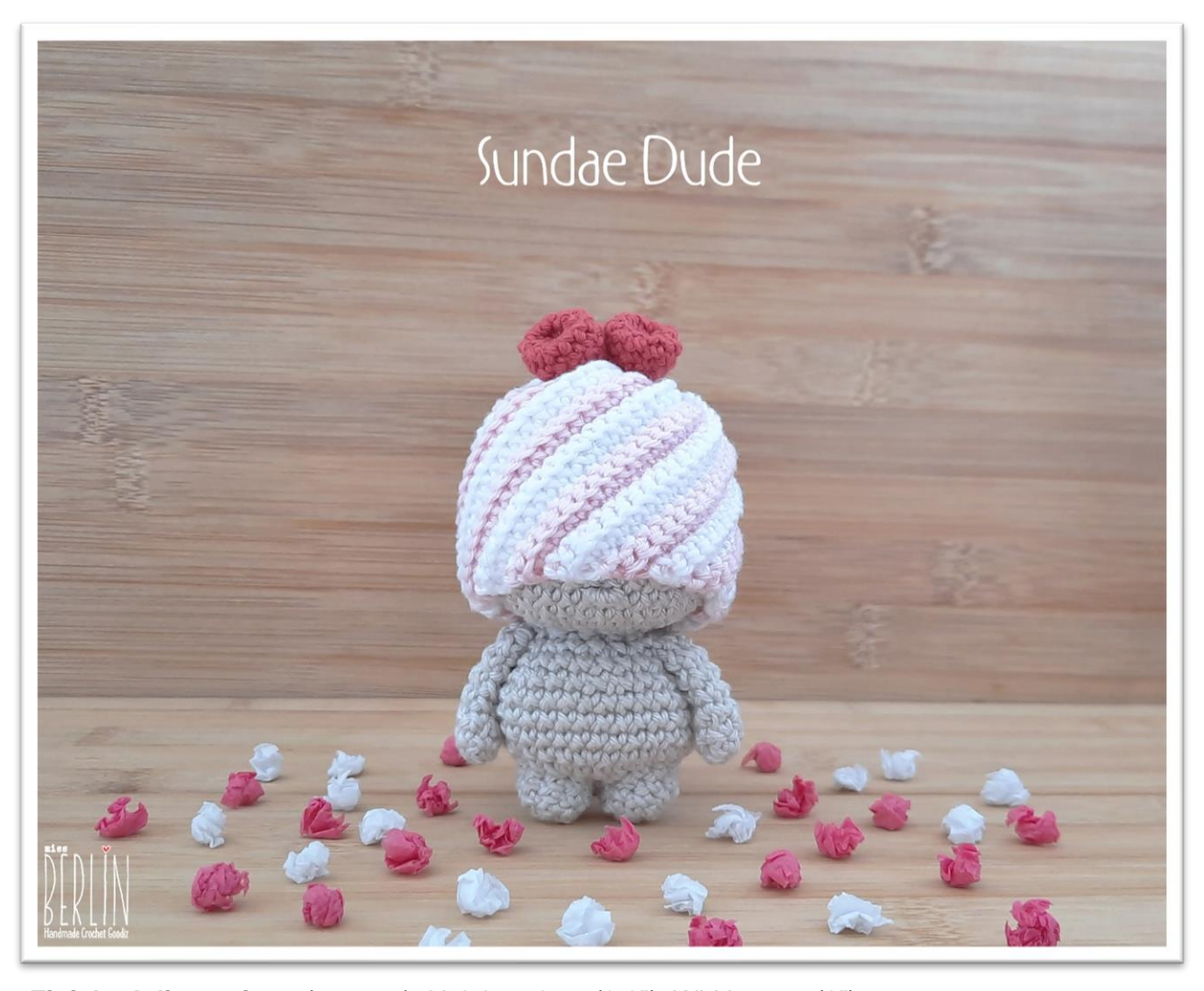
Finished dimensions (approx.): Height: 10cm (3.9"). Width: 5cm (2").