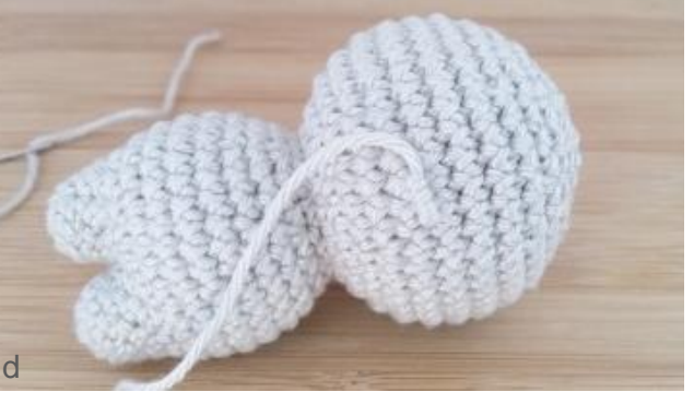
Hide the excess yarn inside the work. FO and weave in the ends.