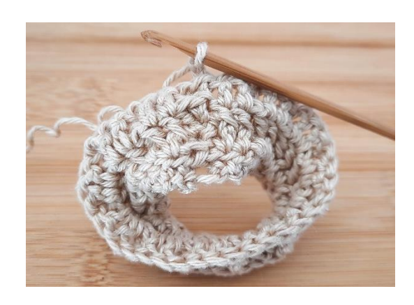
Note - When changing the working direction, you can also turn the work inside-out (when working from the inner side) and back again (when working from the outer side).

R4: *Dc in BB, 2fpdc* rep around [36], ss to 1st dc, ch 1, turn.