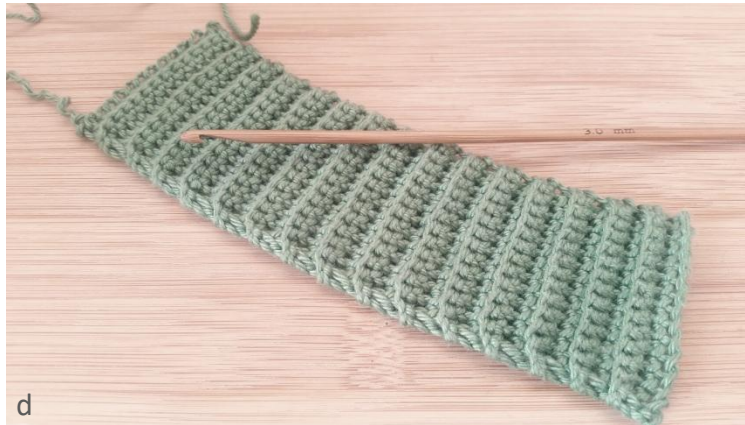
This pattern makes a 3D ridges texture

Leave a long tail and sew both ends together with a whip stitch - →