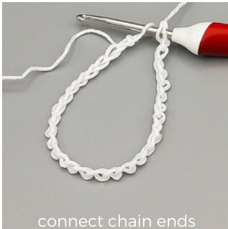
connect chain ends

The side where the increases from the last row meet will be pinned to the chest, the decreases will serve as the back of the neck and point to Ponytas backside.