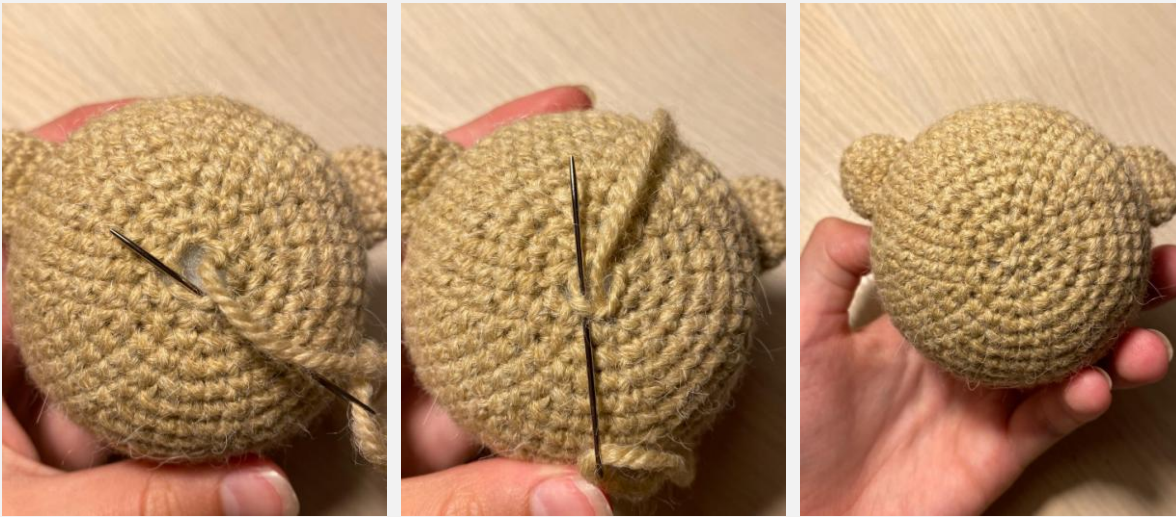
Photo of the stuffed head.