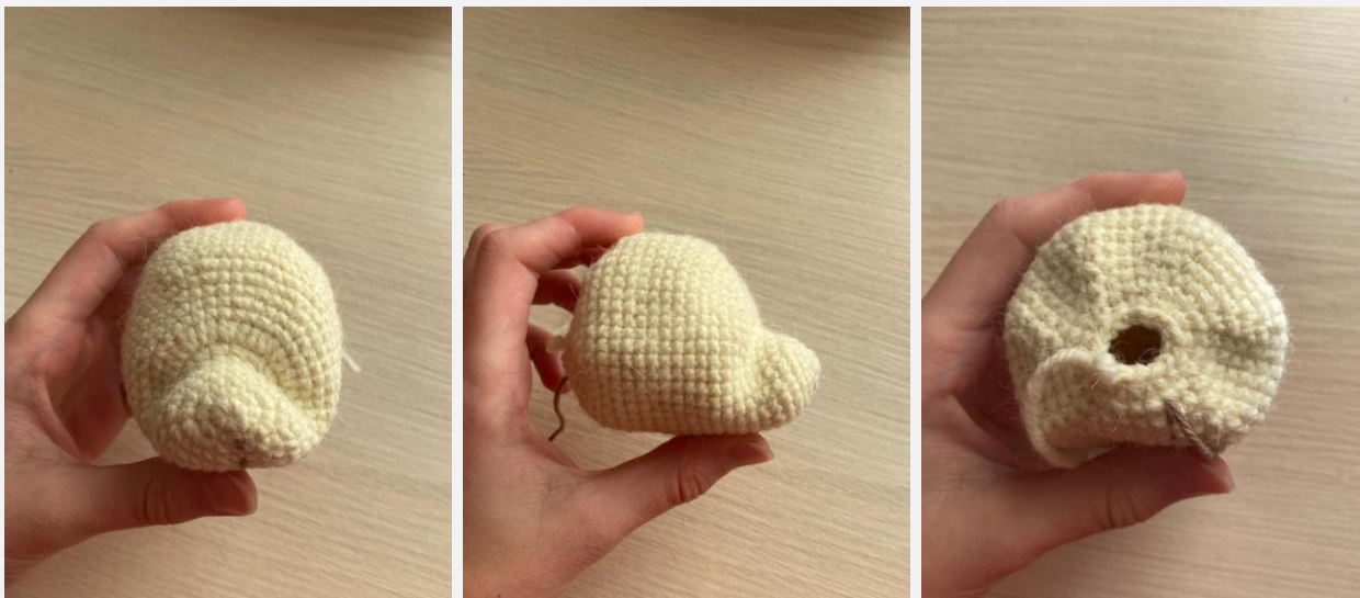
Photo of the head without fiberfill.

Tighten the hole through front loops (see photo) and weave in the yarn ends.