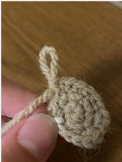
Photo instruction- 3 sc in 1 loop

3) 1 sc, (3 sc in one stitch)*2 times, 4 sc, (3 sc in one stitch)*2 times, 3 sc = 20 sc