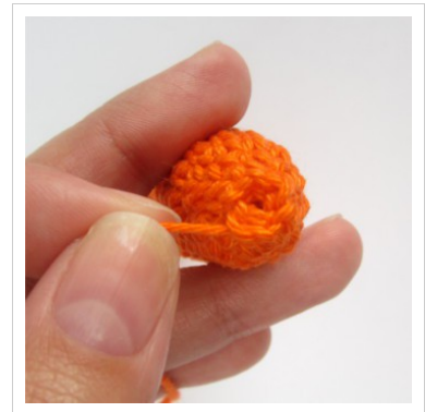
3. Pick up all the stitches. Grab the yarn and pull the center tightly closed.