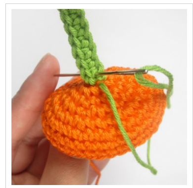
6. Make another stitch through the center of the leaf.