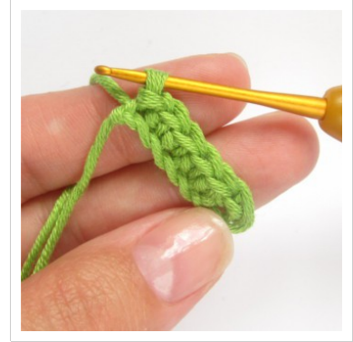
3. Crochet one sc in every chain. Cut the yarn and draw the end through the loop.