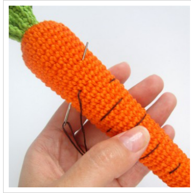
2. Embroider the lines. Go up one side and back down the other.