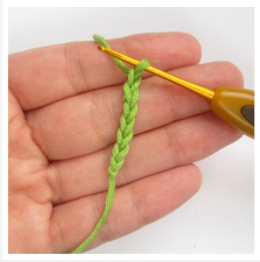
1. Crochet a chain one stitch longer than you want the leaves to be.

Make the leaves and sew them to the top of the carrots.