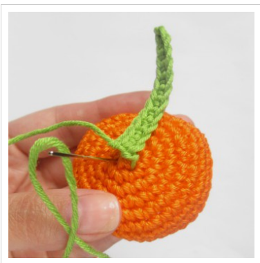
4. Bring the yarn tails to the wrong side.