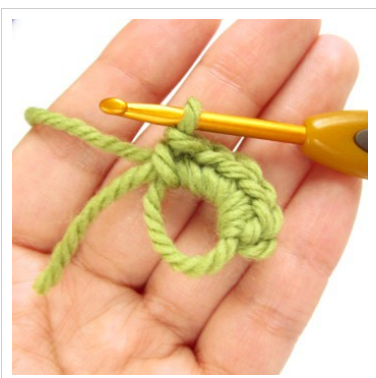
7. Continue crocheting over the loop and the yarn tail until you have the required number of sc for the first round, usually six.