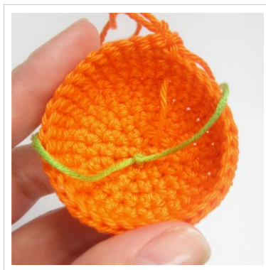
5. Knot the two yarn tails together.