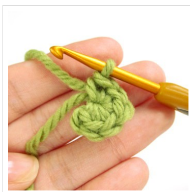
8. Grab hold of the yarn tail and pull until the center is tightly closed.