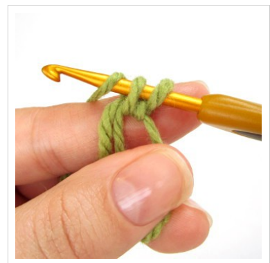
6. Draw up a loop. Yarn over and draw through both loops.