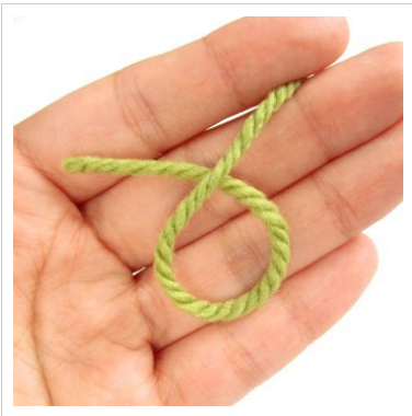
1. Make a loop an inch from the yarn end. Grab the join with your thumb and forefinger.

A magic ring is a way to begin crocheting in round by crocheting the first round in to an adjustable loop and then pulling the loop tight. Alternatively you can chain 2, crochet n single crochet stitches into the second chain from hook.