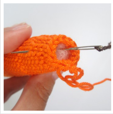
1. Stop before the last few rows. Insert the needle from the bottom.

Embroider the lines before closing the seam.