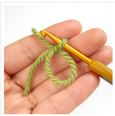
4. Pull the yarn tight. This does not count as the first single crochet stitch.