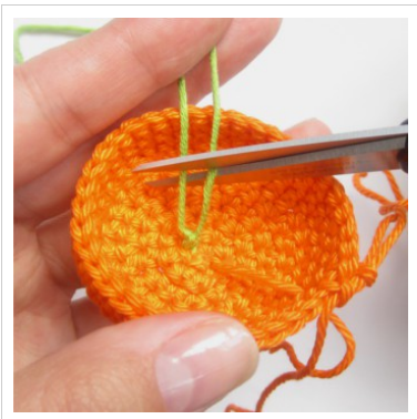
7. Fasten with a knot and cut off the extra yarn tails.