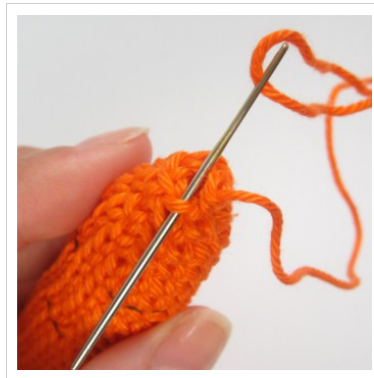
2. Insert the needle from the center and under the front loop only. Draw the yarn through.