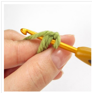
5. Start the first sc. Insert the hook through the starting loop from front to back.