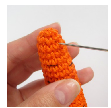
6. Use a needle to push some of the stuffing to the tip of the carrot.

Squeeze and squash the carrot to redistribute the stuffing and coax it back in to a perfect shape.