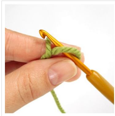
2. Insert the hook through the loop from front to back, yarn over and draw up a loop.