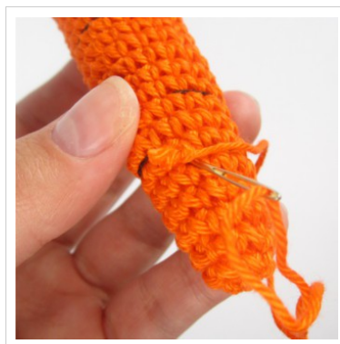
5. Fasten with a double knot and hide the yarn tail inside the carrot (see page 8).