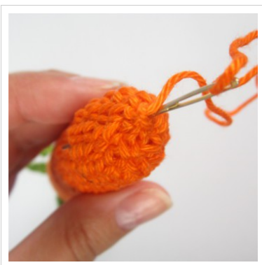
4. Insert the needle into the center and bring the yarn to the side of the carrot.