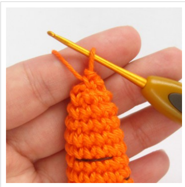
1. Finish the last sc. Cut the yarn, leaving a long tail, and fasten off. Thread it onto a yarn needle.

Close the opening and hide the yarn tail inside the carrot.