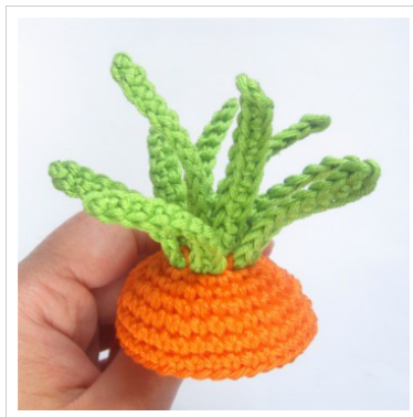
8. Sew all the leaves to the carrot, arranging them in a circle.