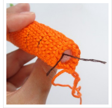
3. Come back out to the bottom and knot the yarn ends together.

Close the opening and hide the yarn tail inside the carrot.