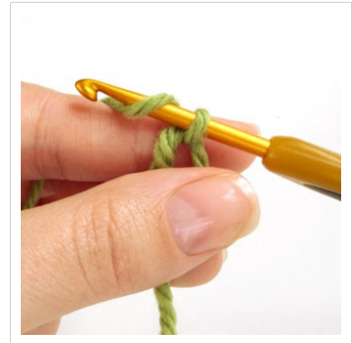
3. Yarn over and draw through the loop.