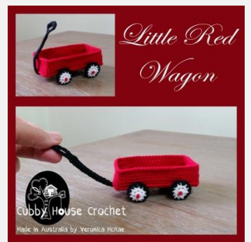
Little Red Wagon