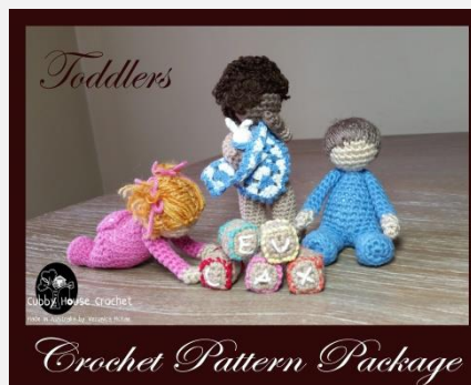
Toddlers BETHANY , EZRA , AIDAN