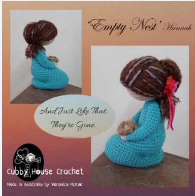
Empty Nest HANNAH

This pattern is available from Etsy and Ravelry