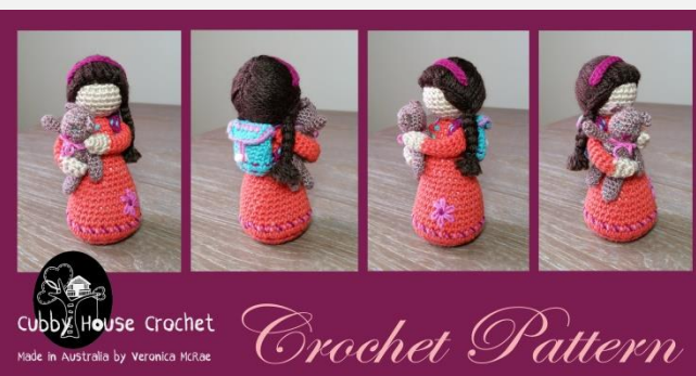
Little Girl MARIA with back pack and teddy