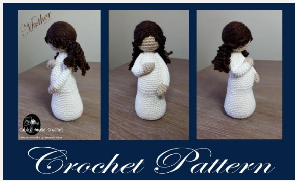
Mother to be EVE