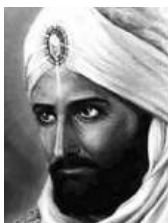
Jehovah-devil, planetary satan, the Owner of the Earth (left).

Who ranked communists and socialists as the left? How you think? Each word or thought bears in itself energy - the order to space for a materialization, manifestation. Left -is destroyers. It is a trick of a devil. Therefore communists, as though they didn't try, are doomed by space to destruction. Communists have to call themselves RIGHT. And, if everything, other parties, leave from them TO THE LEFT, communists will succeed in the noble actions, and left will suffer defeat. Visit a site: http://maitreya-god.net , read all texts. Increase consciousness; only Truth - Wisdom, the Buddhism (Sanskrit) will give knowledge and opportunity to make the correct decisions: to forget about itself and to live for people.