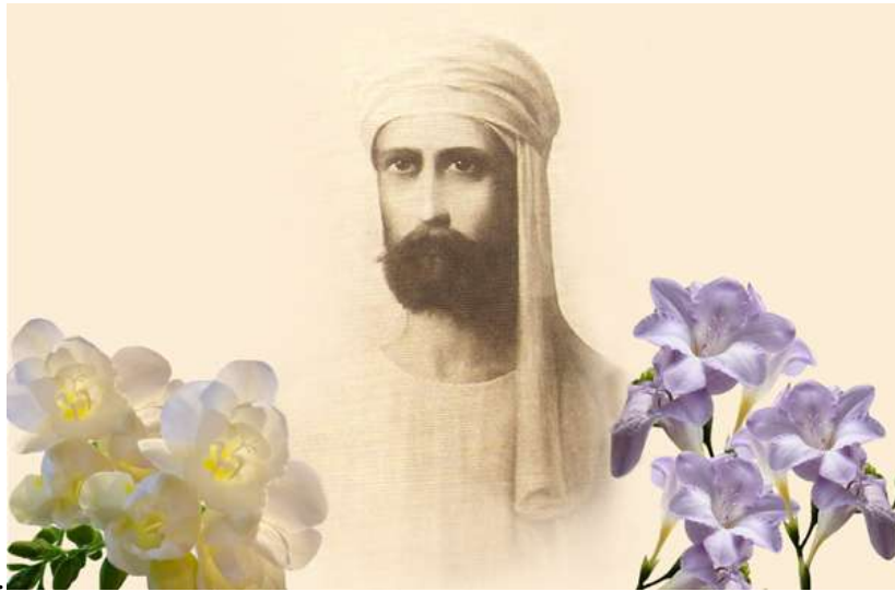
Maitreya – Supreme, the Father of the Universe!

Image of the Great Lords of Shambhala not a picture, or photograph, and is hologram. Maitreya - the Great Lord of Shambhala! Moria, Moriah is one of Buddhist dynasties Magadži, also the name of the tribe radzhputsky (Radzh-King), Solar-dynasty, Hierarchy of Light, M., M.; Mahatma, World-operation invisible, Rossul Moria. Moria is family, where repeatedly incarnated the Great Maitreya - the King the World Government. Avatar future, Allal Ming, is term equivalent to "I" (in first meaning) Words Moriya and Maitreya relate only to the Great Lord of Shambhala. Everyone else to this genus and the name no have nothing of the attitude. Freesia is favorite flowers of the great Maitreya, have a strong and pleasant smell. Flowers of aristocrats!