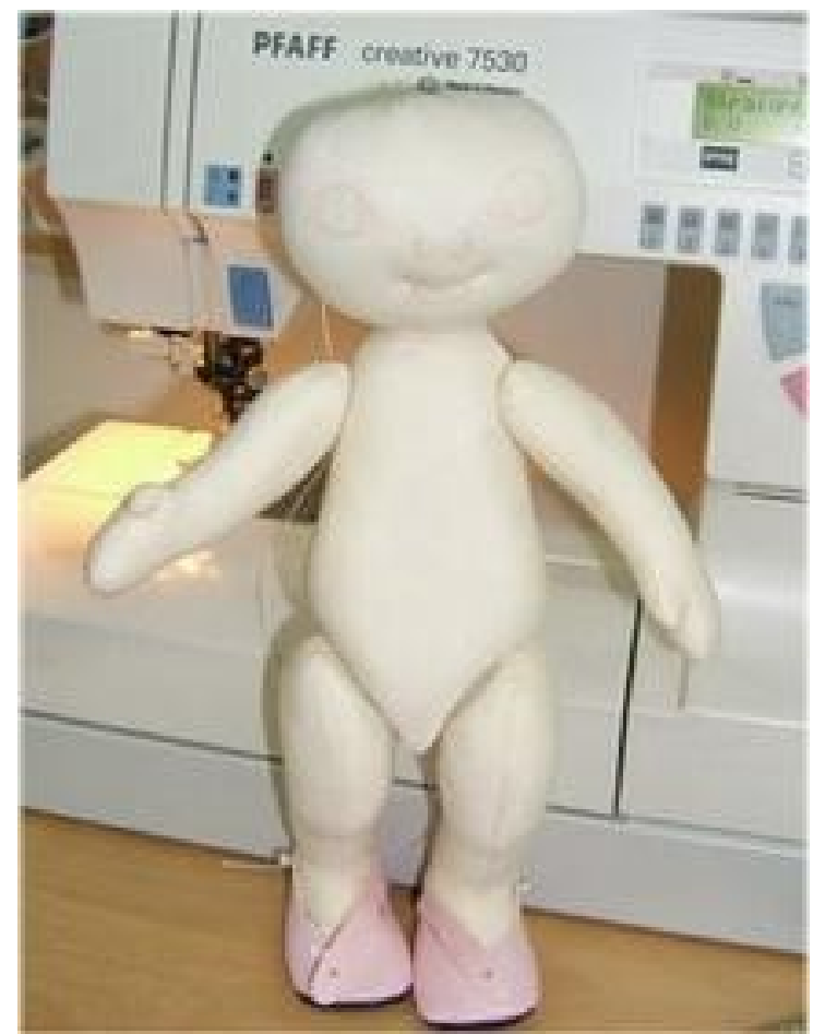
Face drawn lightly. There is a little wood bead in the nose area.