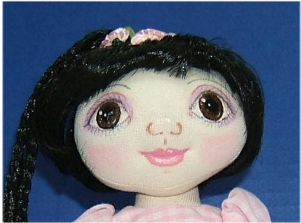
This face is about actual size.