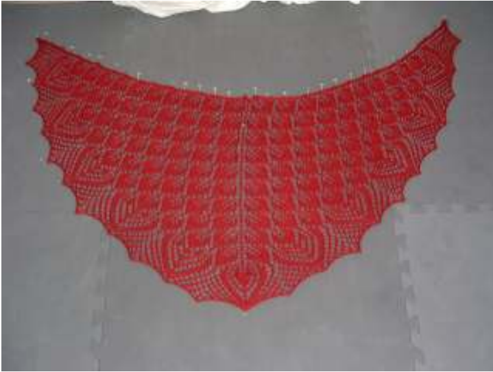
This shawl is worked with the center leaf motif worked on center stitches.

This shawl was worked straight across with the intermediate chart only.