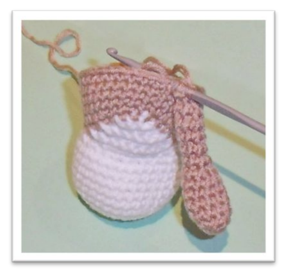
Rnd 21,22: 1 sc in each stitch around = 33 sts

Rnd 23: 1 sc. (1 \text{ dec}, 2 \text{ sc}) \times 8 \text{ times} = 25 \text{ sts}