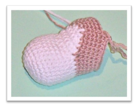
Rnd 20: 4 sc, start to connect second ear: work 3 sc hooking through the part of the ear and the head, 26 sc = 33 sts

Rnd 19: 30 sc, start to connect first ear: work 3 sc hooking through the part of the ear and the head = 33 sts