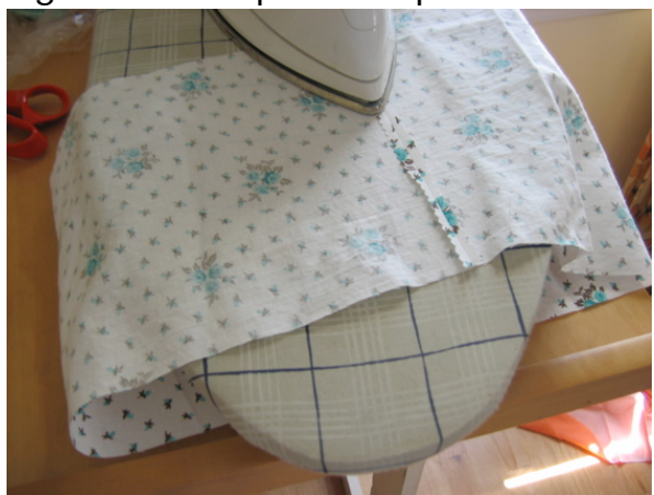
Figure 1. Skirt pressed open