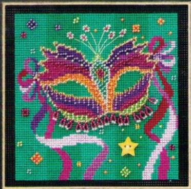
MH14-1102 Purple Mask