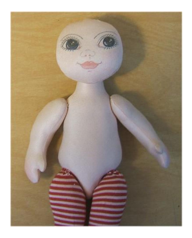
Head tied on. NOTE..I made the stockings bit longer and pulled them all the way up, then gathered them a bit at the top to keep them up.

Add more stuffing through the X forcing it away from the center and making the face wider and firmer