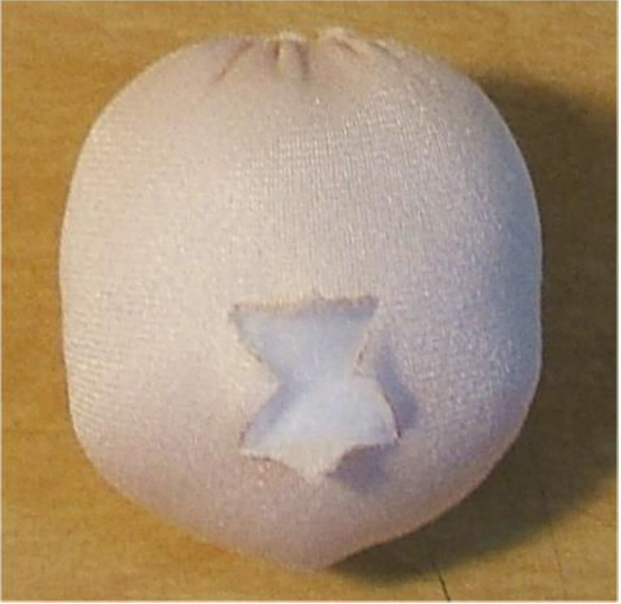
X cut in back.