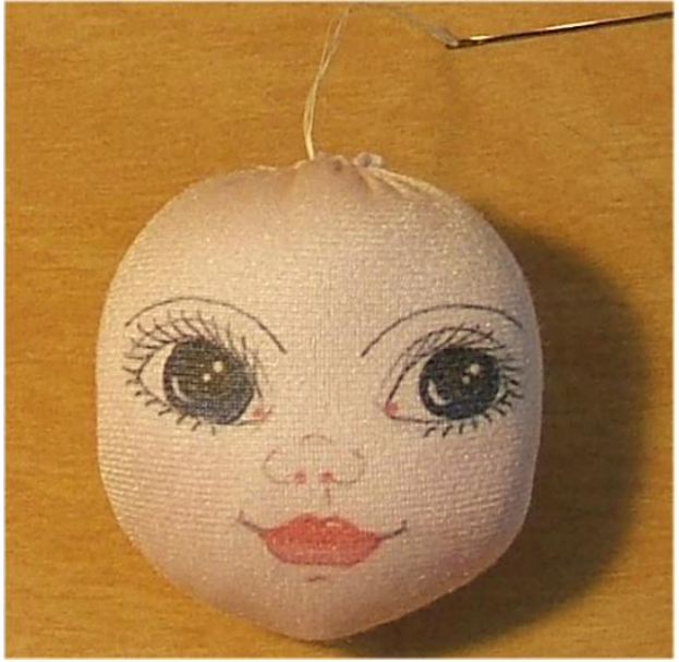
Stuffed and gathered.